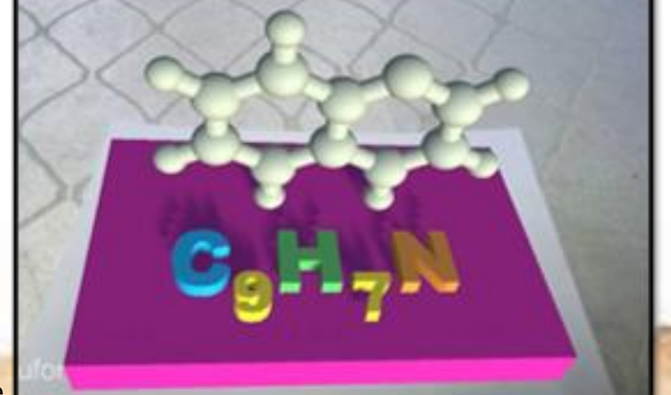
Fig. 4 Augmented reality image of organic compound